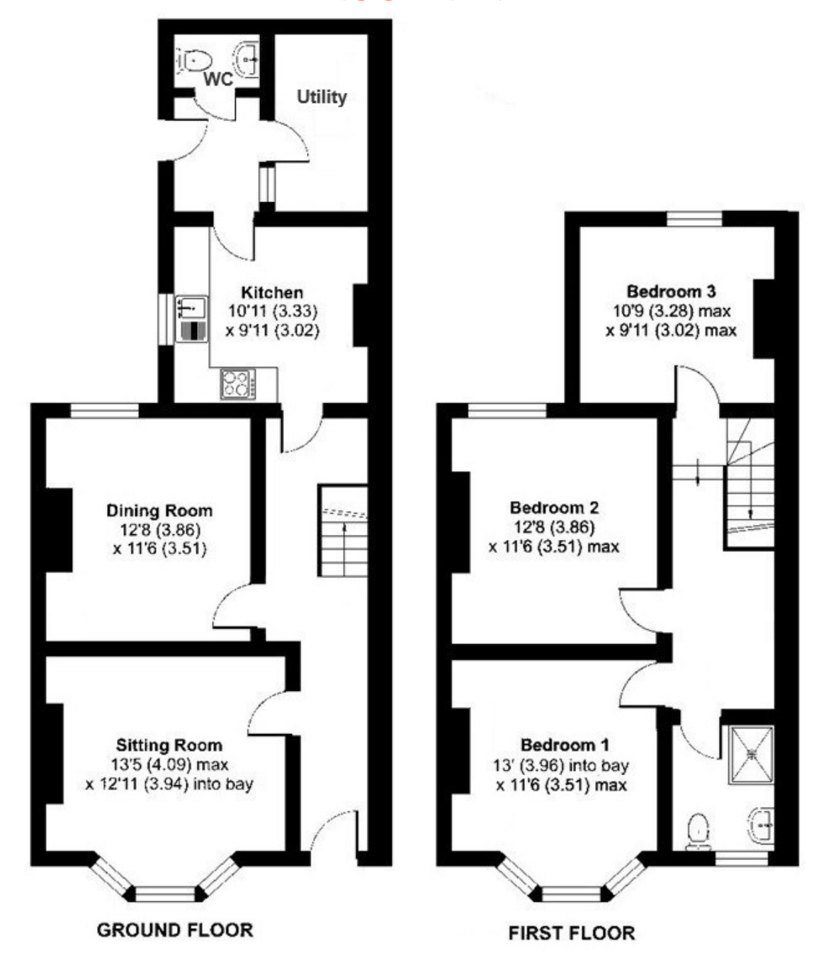
Approximate Area = 1252 sq ft / 116.3 sq m