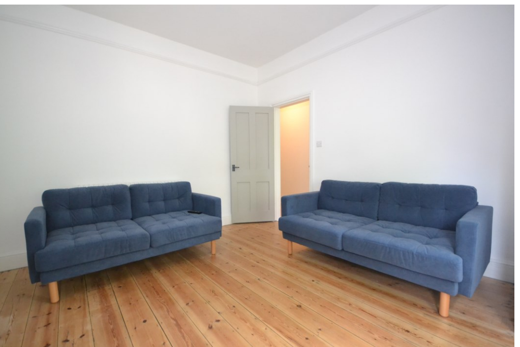
Set within the historic Wareham Walls, this charming semi-detached villa has just undergone a full programme of refurbishment throughout. It now offers elegant modern living combined with many of the character features beloved of this era of property.

You are ideally positioned just a short stroll from the shops, restaurants and facilities of Wareham town centre, as well as the train station with mainline services to London Waterloo. The river is also within easy reach, as well as a variety of footpath walks.