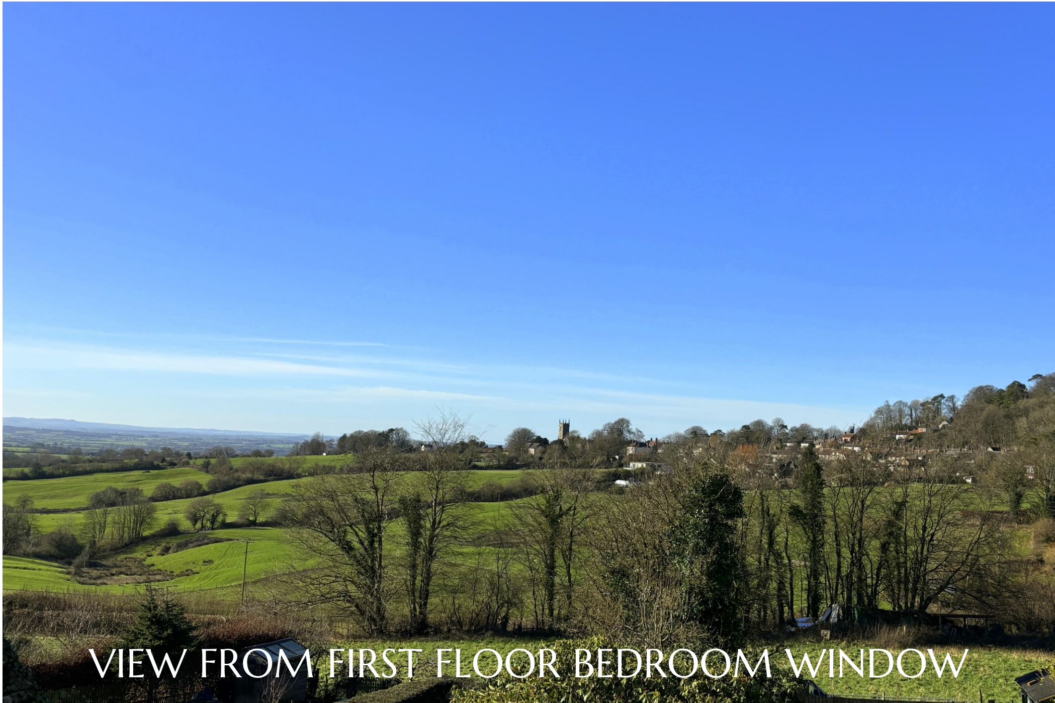
VIEW FROM FIRST FLOOR BEDROOM WINDOW