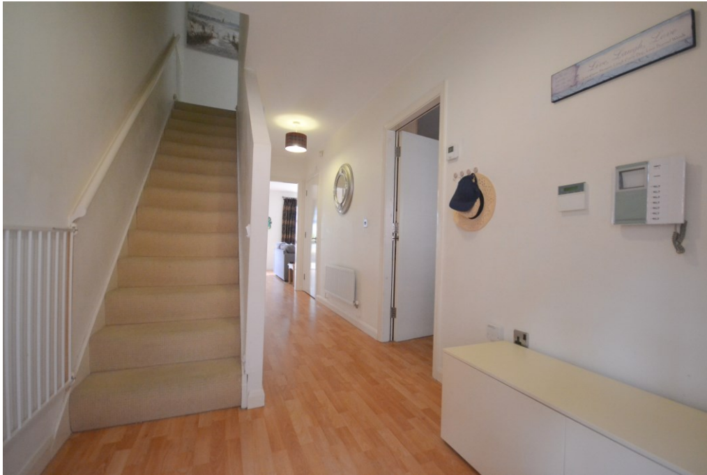
Hallway - 6.2m x 2m (12.4 sqm) - 20' 4" x 6' 6" (133 sq ft)

Laminated flooring, thermostatic radiator, front door with obscure glass panels. Security video entry system and alarm panel